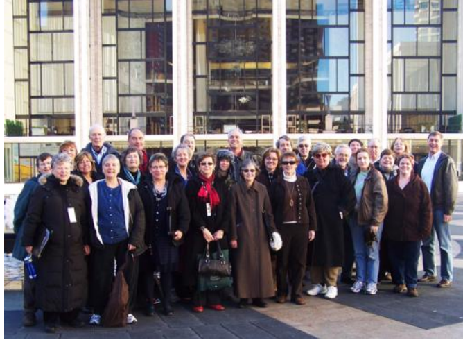
Most of the group in front of the Lincoln Center Fountain